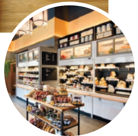
The new LIC interior and, above, assorted cheese-intensive menu items

The new LIC boutique adopts a more European format with customers exploring open cases alongside trained mongers. Next door, the Cheese Bar entices with a menu of heart-meltingly good eats—think chèvre-layered BLT, chicken salad with feta, manchego-infused risotto, and crispy eggplant crowned with burrata. —GERRY TAN